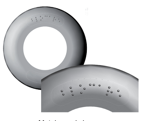
Metal round shape with braille